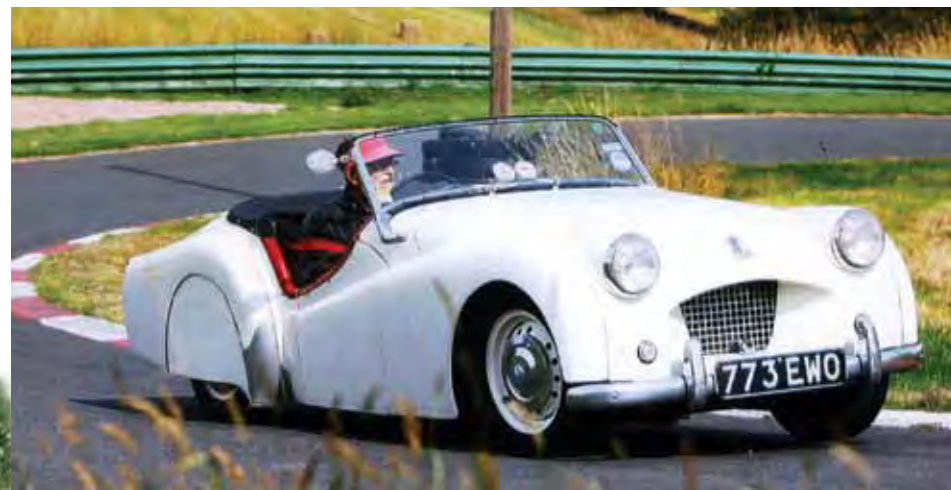
Don at speed driving up the Harewood Hillclimb in TS2 the day before the TR Register's Annual International Weekend. Harewood is in Yorkshire about 30 miles south of Harrogate.

The original carbs and intake manifold are still installed. TS2 has better acceleration than my own TR3A and I would even say it was very noticeable. I feel it must be the cam that made the difference. The displacement is still at the original 1991 cc – like mine. I got 28.8 miles per Imperial gallon, using the lowest UK grade of unleaded petrol and I managed to easily reach 80 MPH on the motorways a few times.