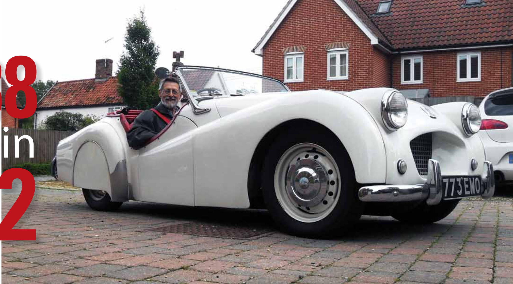
The author and TS2. Driving on the left side of the road was no problem.

I'm very proud of my TR and for years, I have dreamt of shipping it to England to drive it there and to visit some of my friends who are members of the TR Register, but it was not to be. The companies who insure