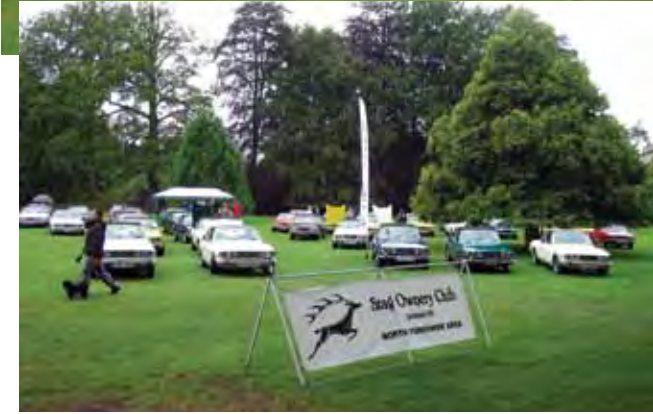
There were about 35 TRs including a beautiful dark blue Swallow Doretti, 40 Stags and almost 1000 other antique cars of all types dating back to 1902 at the Newby Hall Car Show held near Ripon in Yorkshire on a rainy Sunday in July.