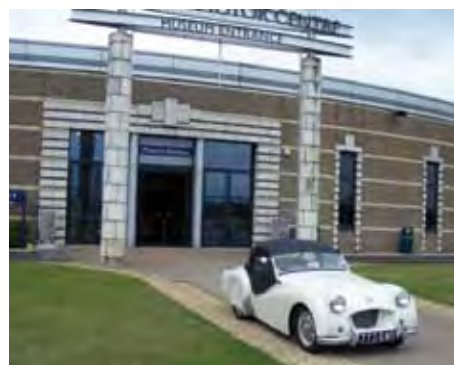
The Heritage Center Museum in Gaydon has an extensive exhibit of almost every car ever built in the UK. Here we see TS2 neatly parked near the front entrance for all visitors to admire. After this photo, the top and sidecurtains were stowed in the boot for the next 17 days. The weather during the rest of the trip was sunny, but very cool.

Early the next morning, after three days and nights of camping in the rain, I packed the soaked camping gear into the TR2. It was still raining as I headed from the campground in Broborough Bridge to-